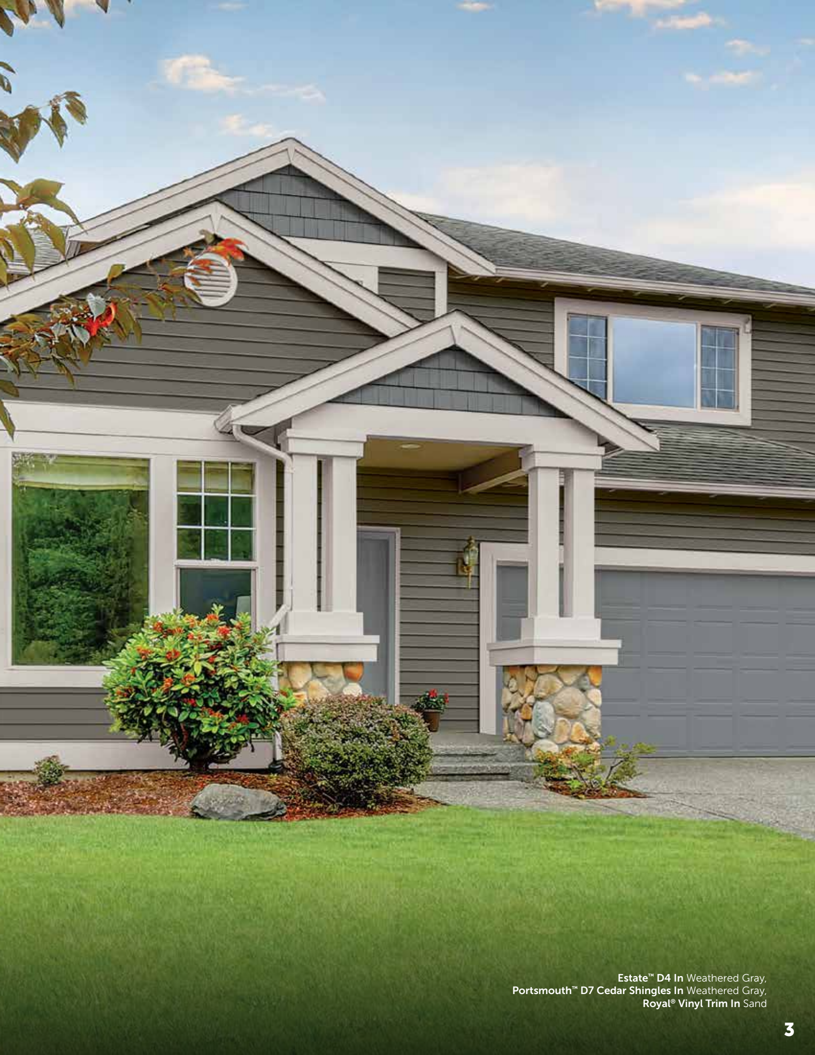
Estate™ D4 In Weathered Gray, Portsmouth™ D7 Cedar Shingles In Weathered Gray, Royal® Vinyl Trim In Sand