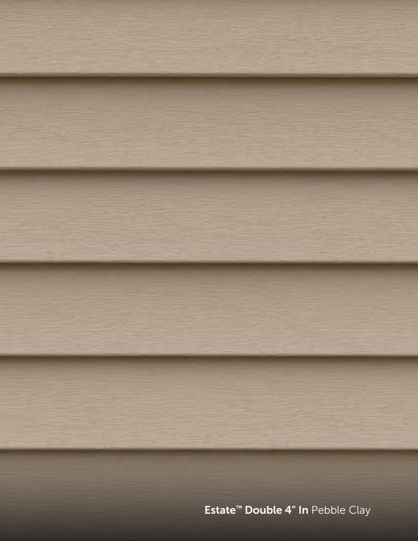
Estate™ Double 4" In Pebble Clay