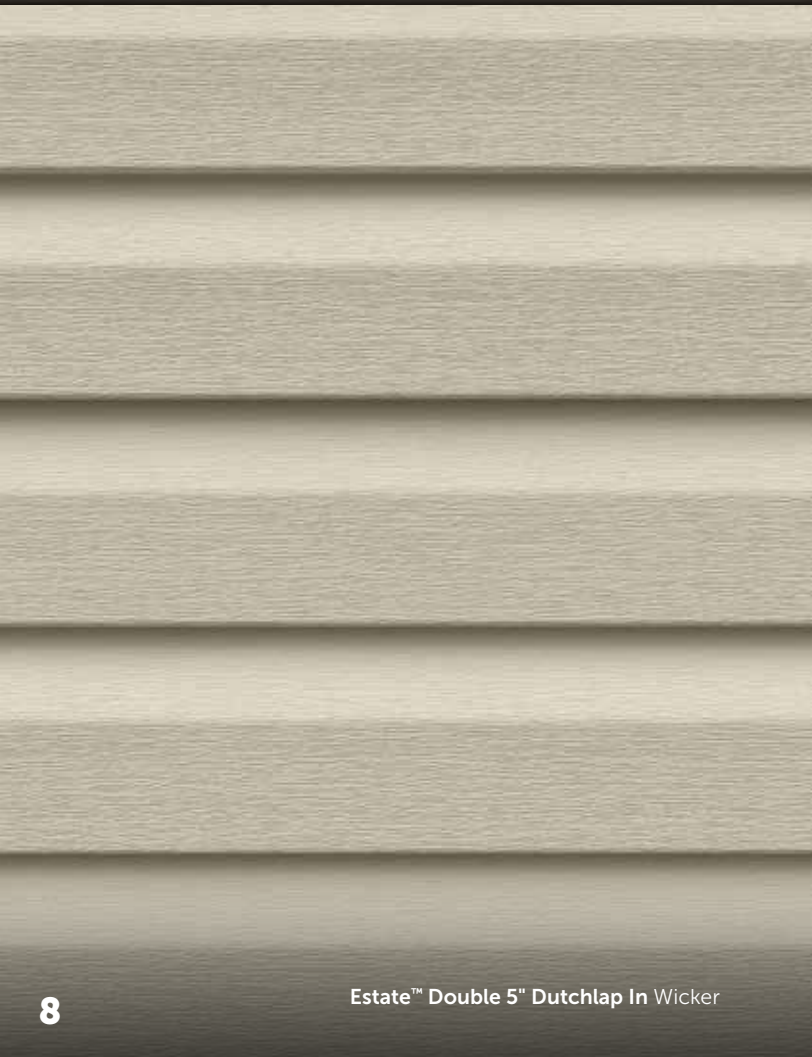
Estate™ Double 5" Dutchlap In Wicker