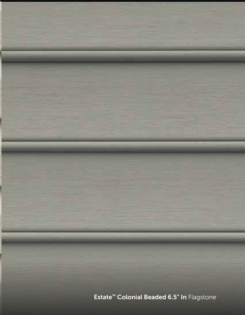
Estate™ Colonial Beaded 6.5" In Flagstone