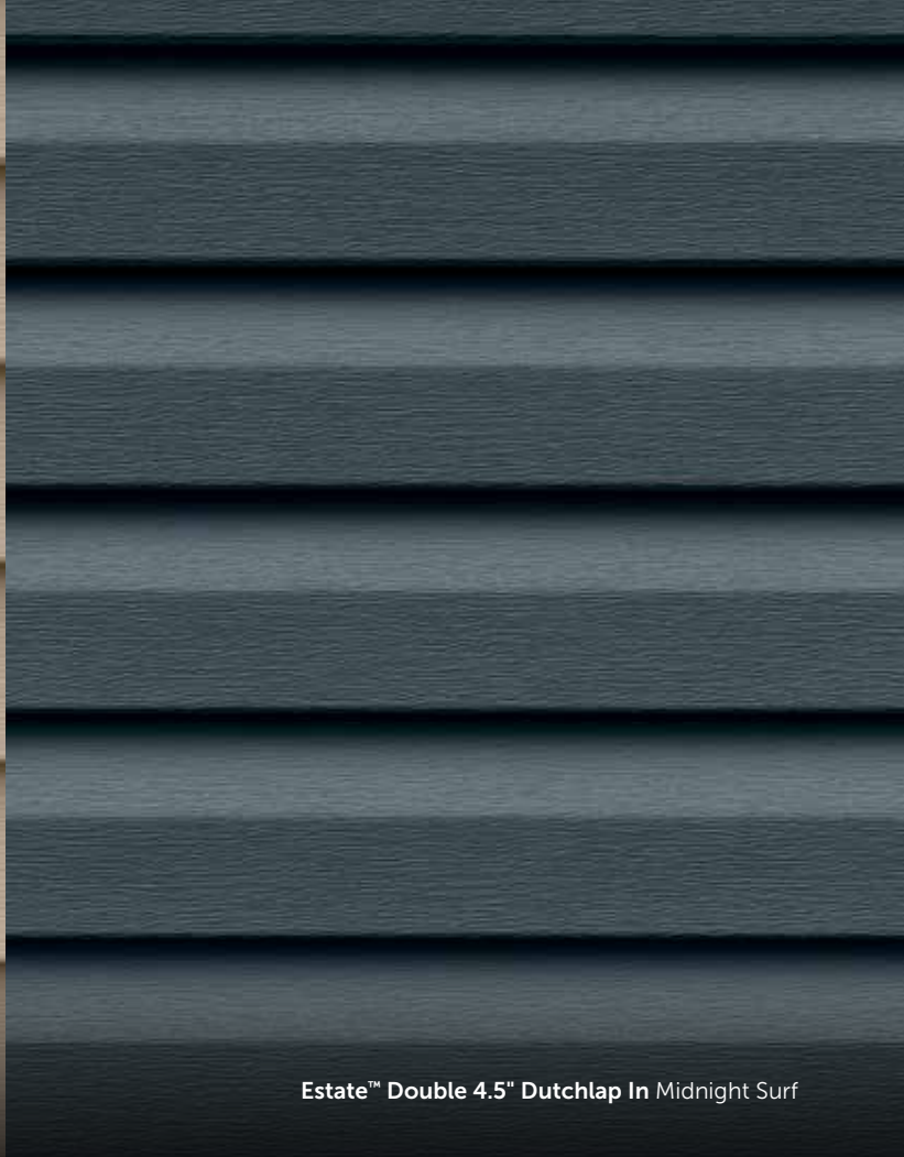
Estate™ Double 4.5" Dutchlap In Midnight Surf