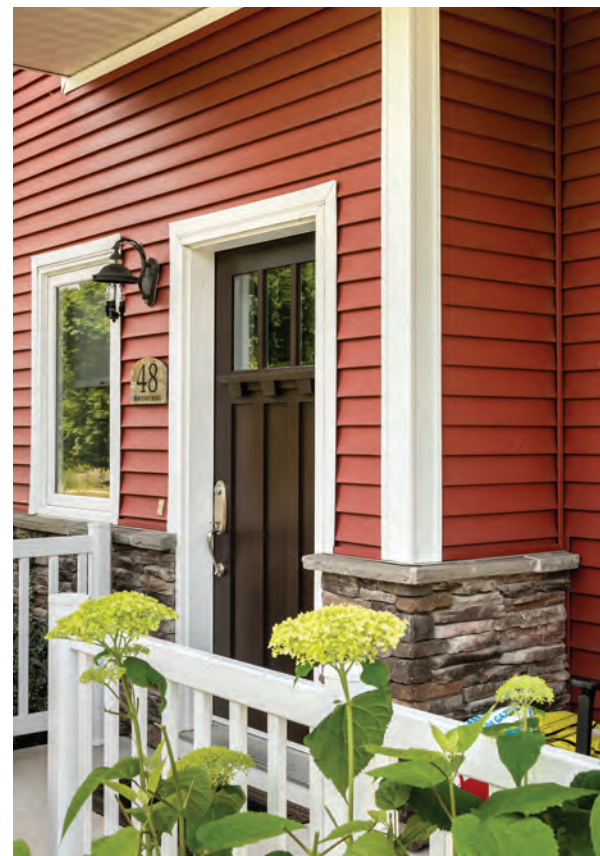
Estate™ D4 in Redwood, Royal® Vinyl Trim in White

PVC resin is the backbone of our vinyl siding, and begins with two abundant building blocks: chlorine from common salt and ethylene from natural gas. The PVC resin is optimized with a range of other proprietary ingredients to provide a reliable exterior product that can be formed into a range of shapes, and last a lifetime.