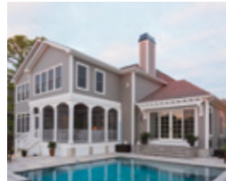
CELECT® CELLULAR COMPOSITE SIDING