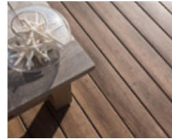
ZURI® PREMIUM DECKING