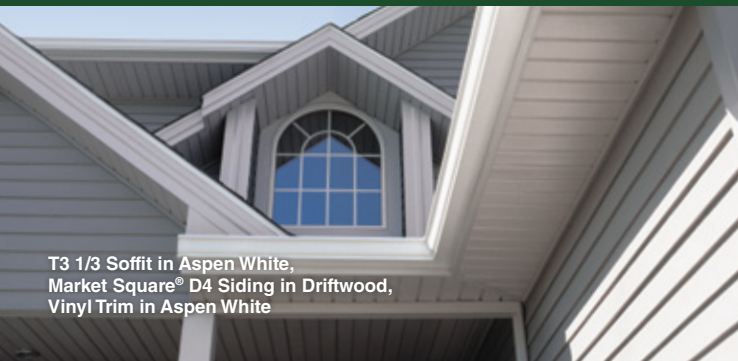
T3 1/3 Soffit in Aspen White, Market Square® D4 Siding in Driftwood, Vinyl Trim in Aspen White