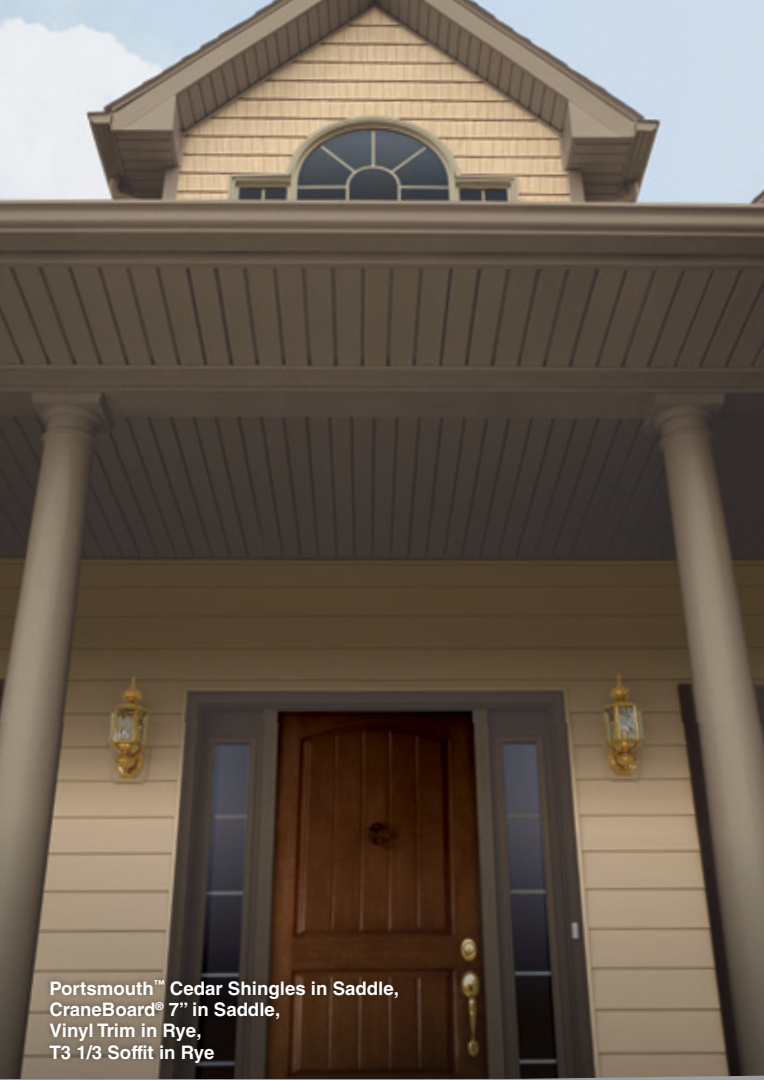
Portsmouth™ Cedar Shingles in Saddle, CraneBoard® 7" in Saddle, Vinyl Trim in Rye, T3 1/3 Soffit in Rye