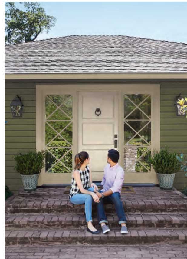
Elm Grove™ D4DL in Cypress, Exterior Portfolio® Vinyl Trim in Rye

PVC resin is the backbone of our vinyl siding, and begins with two abundant building blocks: chlorine from common salt and ethylene from natural gas. The PVC resin is optimized with a range of other proprietary ingredients to provide a reliable exterior product that can be formed into a range of shapes, and last a lifetime.